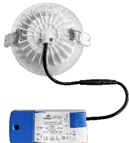
Driver with 0.6m power lead