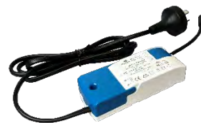
Driver with 240v Plug