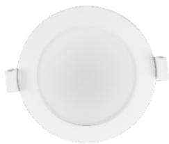
Smart WiFi LED

The Smart WiFi LED is the ultimate lighting solution for all occasions. It provides complete control of your lighting, allowing you to personalise colour hues, colour temperatures, scenes, and lighting schedules via the 'Tuya Smart' App. It also lets you to control lights individually and synchronise them with music. Another convenient feature is that it works seamlessly with Google Home and Amazon Alexa.